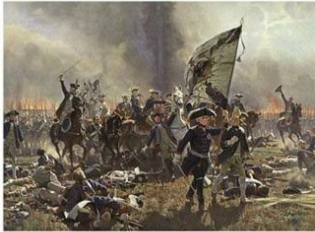
Frederick the Great leads an attack at the Battle of Zorndorf by Carl Rochling.

Frederick took the advice to heart. The army was, and would remain, the primary guarantor of the state of Prussia. A trained and ready force was non-negotiable.