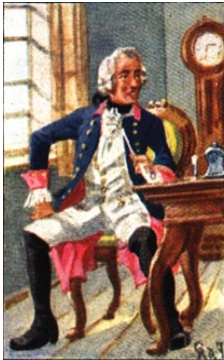
An officer of Infantry Regiment von Lestwitz

Breslau was also home to a university. Aside from military subjects, von Steuben continued to learn French and Russian, both of which would prove useful in later life. He was promoted to Fahnrich in 1749 and served in the position of Premier Leutnant , or the senior lieutenant position in a company. In 1752 he was promoted Seconde-Leutnant , or 2 nd Lieutenant. 9 With the outbreak of war in 1756, Leutnant von Steuben marched into Bohemia with his regiment but did not participate in any battles that year.